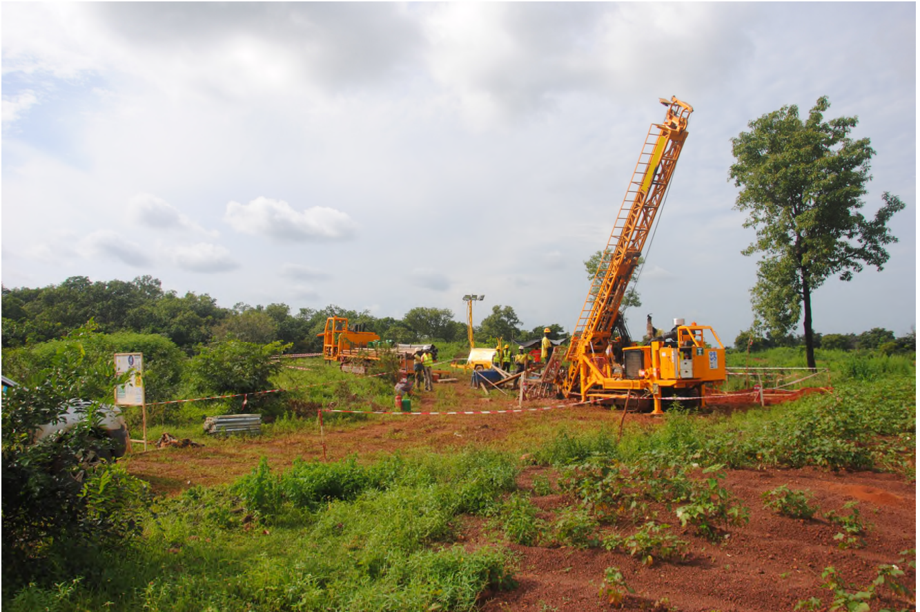
Figure 3: Diamond drill rig active at Mbengué.